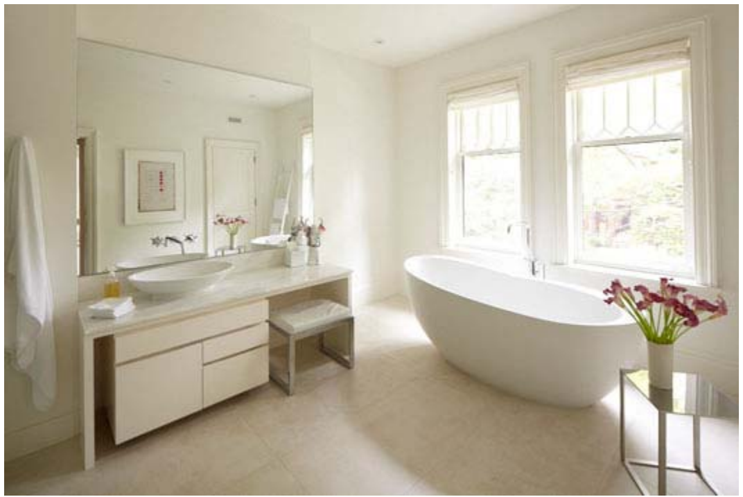
Master bath: tub by Waterworks

VJ: The aim was to create a relaxing home for the family that would be warm, elegant and an oasis of calm. I wanted the house to feel like a retreat. We chose a fairly monochromatic palette. The floors are a luminous white oak. All the walls are white. I love the serenity of white and the way it reflects light. Of course, it is also the perfect backdrop for an art collection.