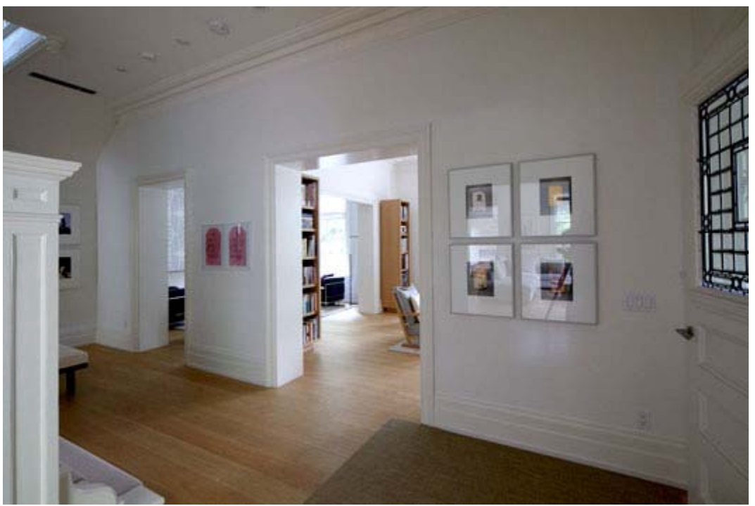
Hall: Photographs (left) by Arnaud Maggs "Travail des enfants dans l'industrie 9 et 9 bis"; photographs (right) by Angela Grauerholz, "Privation" series

VJ: This is a work by An Te Liu made from hand-printed silkscreens on paper. It is an aerial view of the late 40s Levittown housing development on Long Island. The photographic image is manipulated into symmetrical diamond patterns to appear as if you are looking through a kaleidoscope. I find it mesmerizing and refreshingly ornamental in an otherwise minimal room.