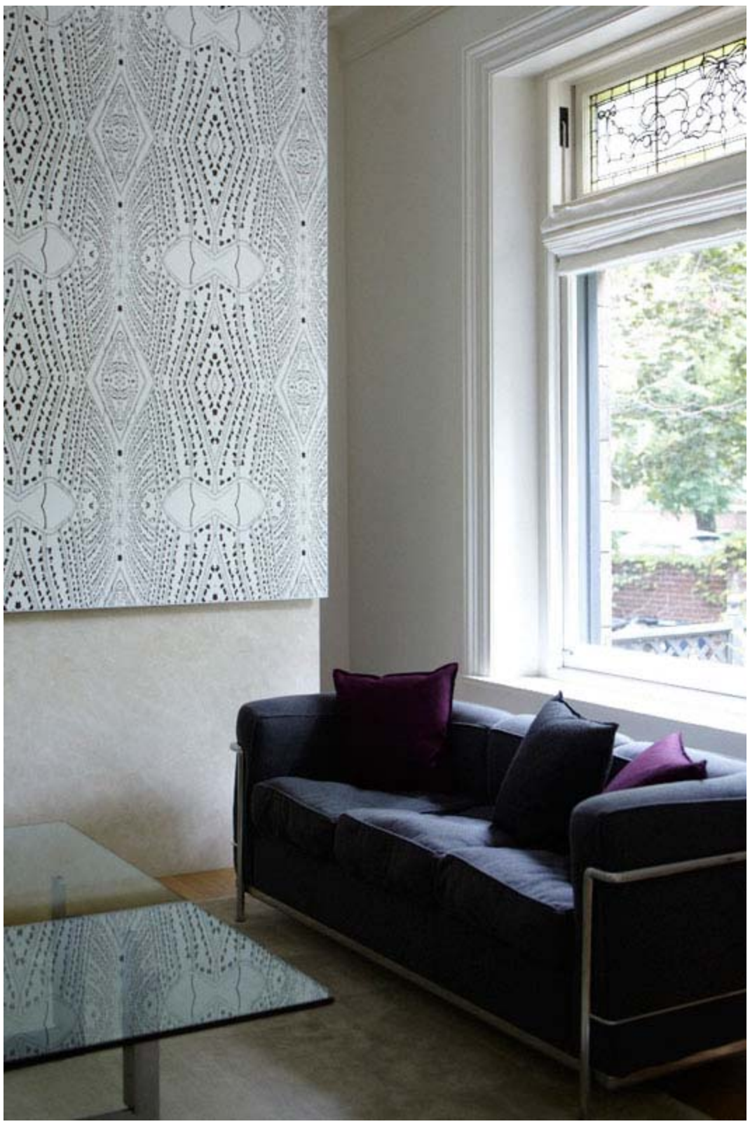
Sitting room detail