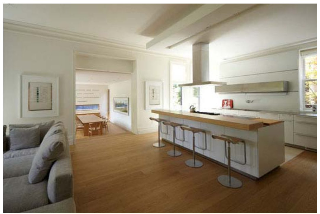
Kitchen and family room: bultaup b3 kitchen system with anodized aluminum wall panels, matte lacquer cabinetry; countertops in stainless steel and quartz; bar top in white oak; (on counter in red) Vitra's "Mother and Child" tray by Alexander Girard

BK: The original kitchen was very small and dark. Two walls were demolished to create a large open kitchen and family room. We installed a bulthaup kitchen which is not only a high performance cooking space but is also very beautiful. It is great for day-to-day living as well as for dinner parties and events.