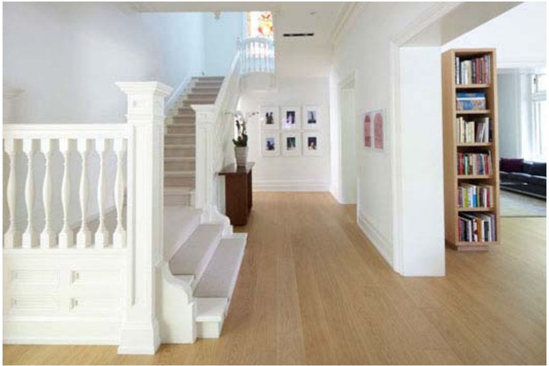
Entrance: Photographs by John Massey from his "Adam and Eve" series

Bruce Kuwabara: I see the contemporary additions and interventions as a dialogue between two architects working in different languages over 100 years apart. A gradual transition was orchestrated from the front living room which expresses the volume and details of the original architecture to the dining pavilion, which is a completely new addition and contemporary in all of its details. The interior is uncluttered and serene. It works wonderfully for family dinners and large gatherings because it has good flow and spaces that are connected, generous and open.