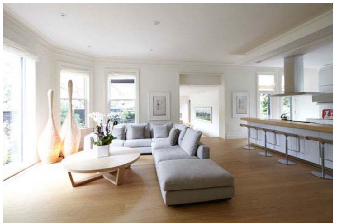
Family room: Sectional by Rodolfo Dordoni for Minotti; white oak "Xilos" coffee table by Antonio Citterio for Maxalto; "Bolla" floor lamps by Michael Sodeau for Gervasoni; "Lem" bar stools by Lapalma

BK: New crown moldings, base boards and window trim were made to match the profiles of the original plaster and wood details. The coal-burning fireplaces were enlarged and converted to wood-burning ones. We replaced all the windows, matching the profiles of the originals. The house had sagged and settled over the last 100 years, so the floors had to be restructured and leveled. The roofing was replaced, and the exterior brick and stone were re-pointed. We added new stone stairs and a flamed black granite driveway that creates a generous sense of entrance.