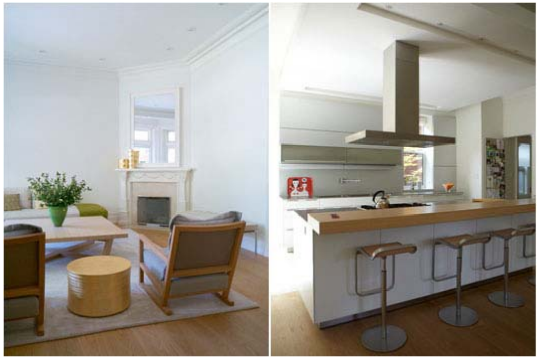
Living room: white oak "Xilos" coffee table from Maxalto; Maxalto "Clio" armchairs; stool in gold foil by Marcel Wanders; bench designed by Florence Knoll, 1954; original fireplace mantel; "Joker" vases in gold foil by Nicole Aebischer for B&B Italia. Kitchen: on counter, Vitra's "Mother and Child" tray by Alexander Girard.

BK: The one-story dining pavilion has large sliding doors that open up into a private courtyard garden creating a fluid transition between indoor and outdoor space. The overhang provides protection from the sun and rain. It also blocks the view of the apartment tower and frames the view toward the park, creating a porch. We built a steel and stained wood fence that is 8 feet high. It creates privacy as well as a very elegant backdrop for an outdoor room, while maintaining views of the sky and the upper boughs of mature trees in the park next door.