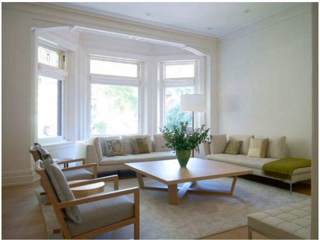
Living room: "Charles" sofa by Antonio Citterio for B & B Italia; white oak "Xilos" coffee table from Maxalto; Maxalto "Clio" armchairs; tripod lamp from BDDW; stool in gold foil by Marcel Wanders; bench designed by Florence Knoll, 1954