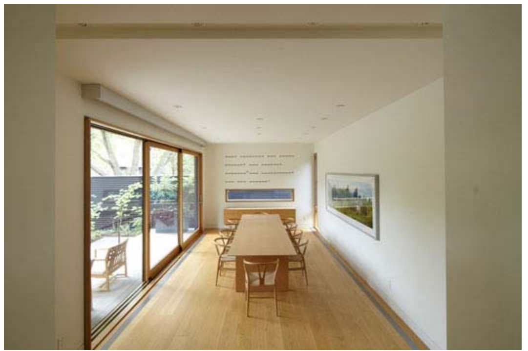
Dining room: Custom dining room table by bulthaup; Hans Wegner's 1949 "Wishbone" chairs; photograph (right) "Orchard View, Late Spring, Vitis vinifera, Wisteria, 2004" by Scott McFarland; far wall installation by Michah Lexier, "Fill in the Blanks (72 characters)"

Rana: The dining room looks out onto a private green filled courtyard, which brings in a lot of natural sunlight. Was outdoor space an important component in the overall design?